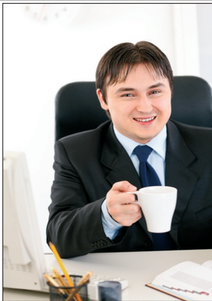
TROUBLE BREWING... Ledger Lover FD Drastic enjoying a UK-sourced cuppa before the scandal broke.

'Furthermore,' he added, 'for some time there have been allegations of extra-cuppas